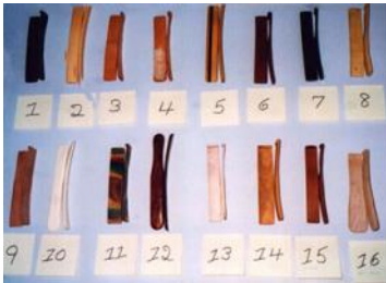
A FEW OF THE MANY BONES IN USE