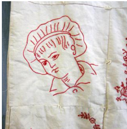
Character from a Kate Greenaway book.

The ladies of the Quilt Society advised us to display the quilt on "special occasions" because of its age and fragility. We will have it for display on Old Home Day, Saturday August 3rd. However, we have photographed each square and will have a book of them for anyone who wishes to come in and have a look. The Campton Historical Society is open every Thursday from 9 to 4.